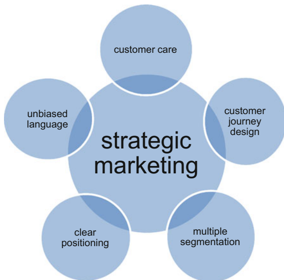
Fig. 7.2 Strategic marketing tools for targeting older tourists. Source Author's elaboration

Floreali makes frequent stops at rest rooms to respond to, or better, anticipate an unexpressed need.